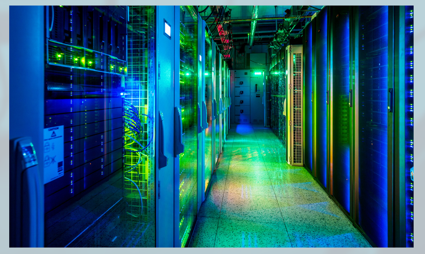
Figure: CIŚ computer cluster at NCBJ, that helps Complexity in Materials research group perform its' research

The big picture is about the long-term potential as NOMATEN starts to produce experimental datasets for various advanced materials and the key concept is the combination of workflows for data analysis with Open Data.